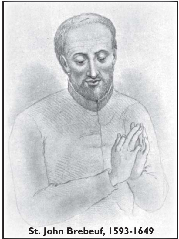
St. John Brebeuf, 1593-1649